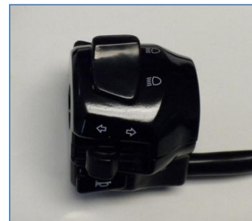
K&S 12-0041B Universal DOT T/S Switch Black