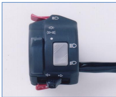
K&S 12-0030 Universal DOT T/S Switch