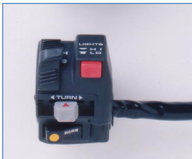
K&S 12-0040 Universal DOT T/S Switch Compact