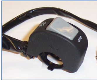
K&S 12-0051 Universal Headlight Switch