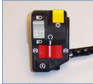
K&S 12-0052 TRX-Type Switch