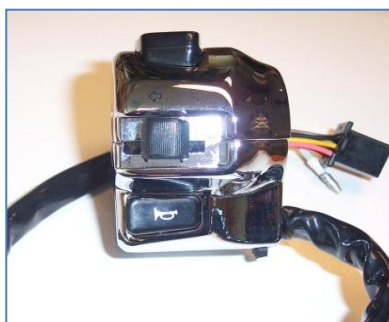
K&S 12-0041 Universal DOT T/S Switch Chrome