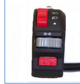
K&S 12-0055 Off-Road Switch