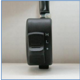
K&S 12-0050 Headlight / Kill Switch