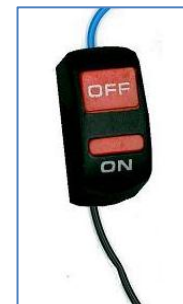
K&S 12-0200 Starter Switch